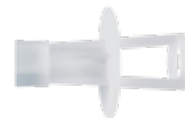
Port Fitting for Bag Installation